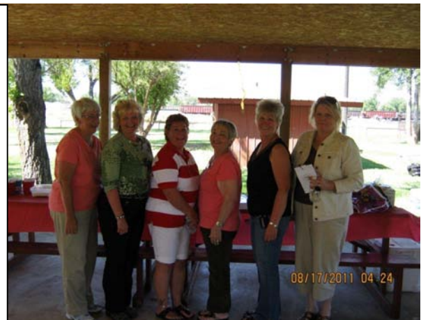
“The Rosebuds” from Forsyth, Montana- Lodge 486. Welcome New Members!