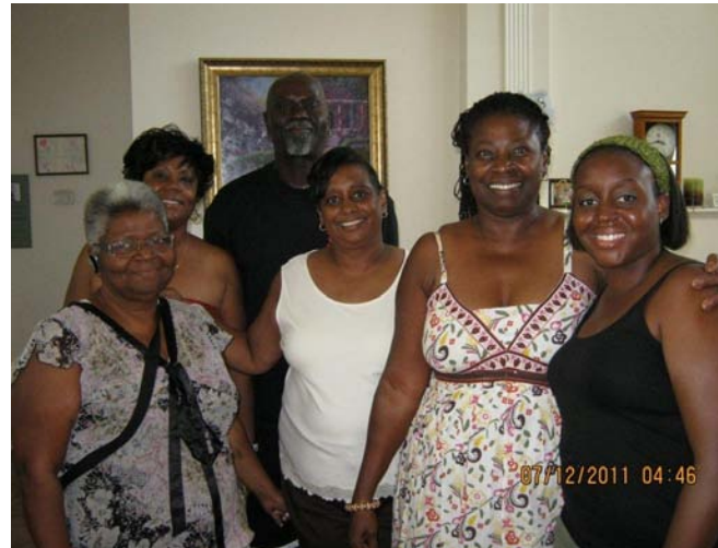
Members of East Houston- Missouri City Lodge 281. Welcome New Members!